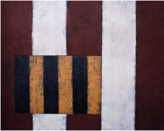
SEAN SCULLY, Cathedral , 1989